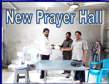
New Prayer Hall