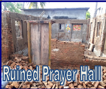
Ruined Prayer Hall