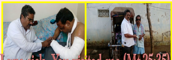
I was sick. You visited me. (Mt. 25:35)