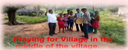
Praying for Village in the middle of the village.