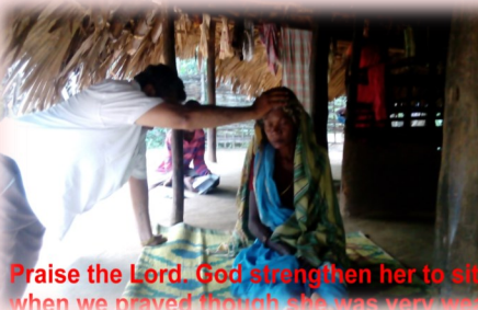
Praise the Lord. God strengthen her to sit when we prayed though she was very weak.

Prophecy says about Jesus in the "Book of Isaiah" The Spirit of the Lord GOD is upon me; because the LORD hath anointed me to preach good tidings unto the meek; he hath sent me to bind up the brokenhearted, to proclaim liberty to the captives, and the opening of the prison to them that are bound; To proclaim the acceptable year of the LORD, and the day of vengeance of our God; to comfort all that mourn; To appoint unto them that mourn in Zion, to give unto them beauty for ashes, the oil of joy for mourning, the garment of praise for the spirit of heaviness; that they might be called trees of righteousness, the planting of the LORD, that he might be glorified. If it must be Jesus ministry, what about us? That's why Jesus The Way Ministry took this prophecy as it's vision for Social Gospel Movement through services to bring the Unreached, unfortunate gentiles to Salvation of Jesus Christ. We preach, pray for sick, comfort, speak, advice, warn through entertain through Christian Movies to these innocent people. Please pray that we need a portable generator for this project..